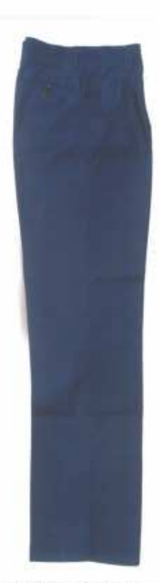
TROUSERS FOR CLASS VI-XII