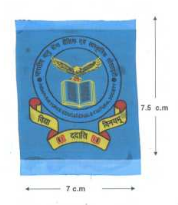
MIDDLE SIZE LOGO(7.5 CM X 7 CM) FOR MIDDLE CLASSES (VI TO VIII)