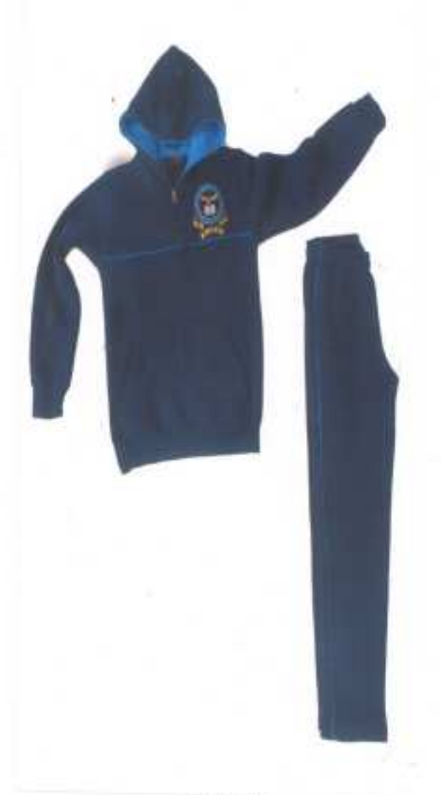
T SHIRT WITH TRACK PANT